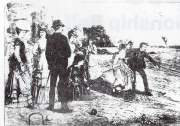
CROQUET UNDER DIFFICULTIES Approximate size 37 x 28 cms £5.00

These unusual hand coloured prints make an ideal gift for croquet players.