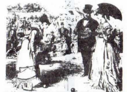
ALL ENGLAND CLUB AT WIMBLEDON 1870 Approximate size 30 x 27 cms £4.00

Available from: JOHN ROSE, 20 Willowside, Woodley, Reading, Berkshire. RG5 4HT.