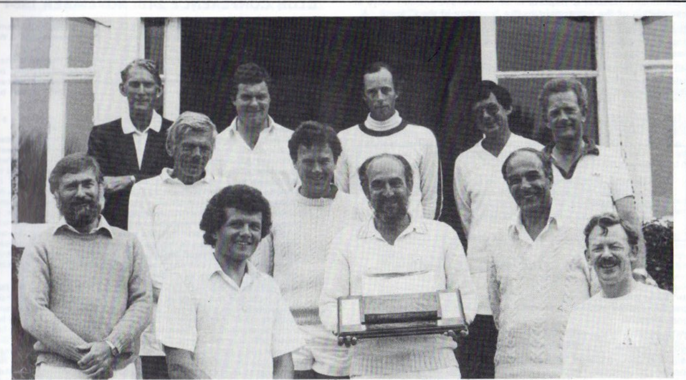
Croquet Association v. Ireland McWeeney Trophy - Report on page 5