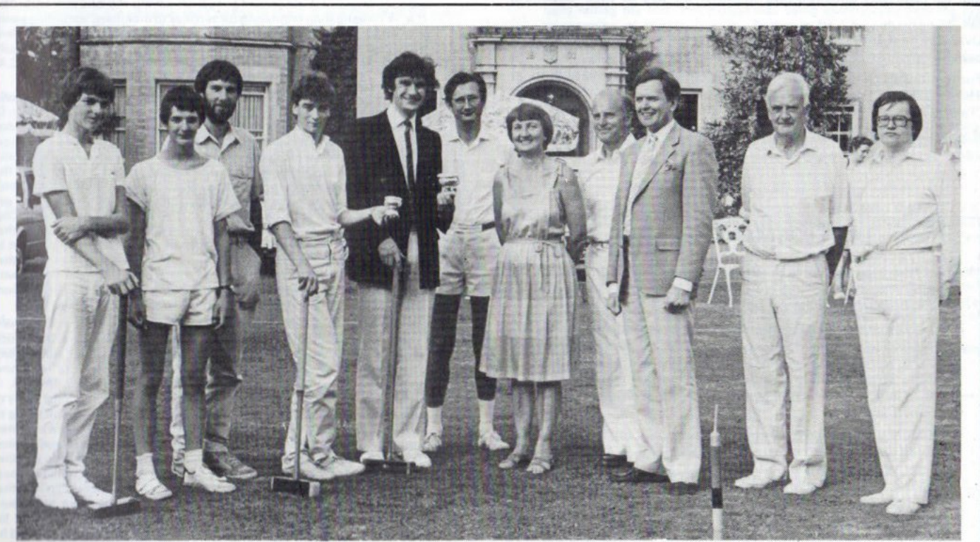
Woodlands Manor Croquet Tournament - Report on Page 5