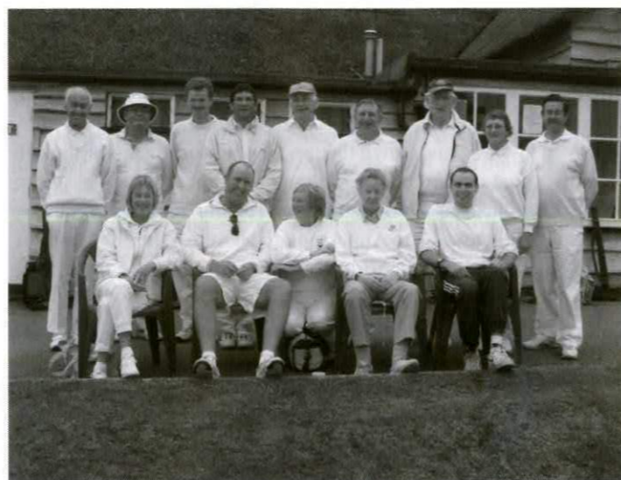
A happy little group of competitors at Sidmouth.

A cool North Easterly wind with bright warm sunshine gave