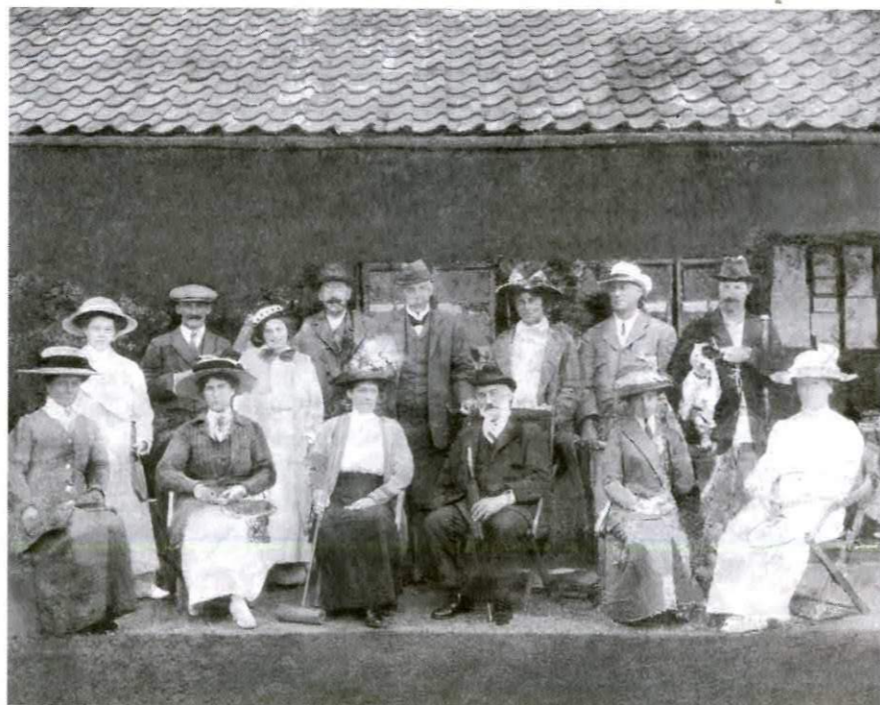
Pre World War I Members at Woking

Players who were fostered out to play at nearby residences were very well looked after and "several well-known hostesses in the locality entertained large house parties and were present in force at the tournaments, much to the delight of the representative