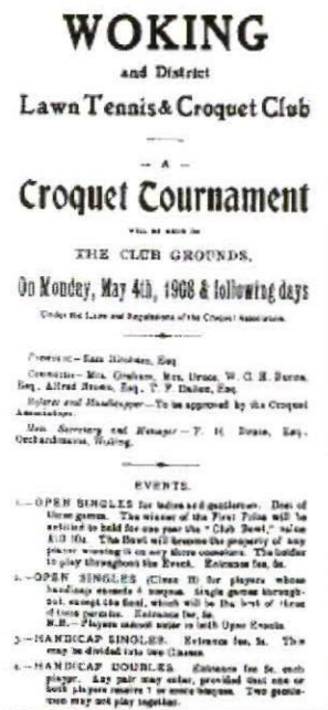
Gazette advertisement for the first Woking open tournament in 1908

The Club started its first annual open week long croquet tournament on Monday the 4 th of May 1908, there being no matches played in those days over the weekends and indeed no play of any description permitted on Sunday mornings. Woking is one of only four clubs in the country that has a virtually unbroken record apart from the periods of the two world wars, of holding annual weeklong open tournaments.