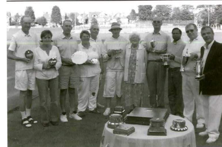
South of England Week at Compton CC Eastbourne.

I begin with some excellent news. The World Croquet Federation (WCF) recently established a Hall of Fame, to which