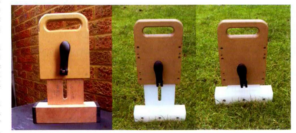
Left to right: The plywood prototype, Polypropylene mallet extended and Polypropylene mallet closed.

While playing in the B level advanced weekend tournament at Sidmouth this season I took this photo of their beautifully re-thatched pavilion. I wondered if anyone can match this with a similarly outstanding example of traditional building crafts at a croquet club. At Sidmouth they also have a thatched hut providing shelter adjacent to Lawn 4. Michael Poole