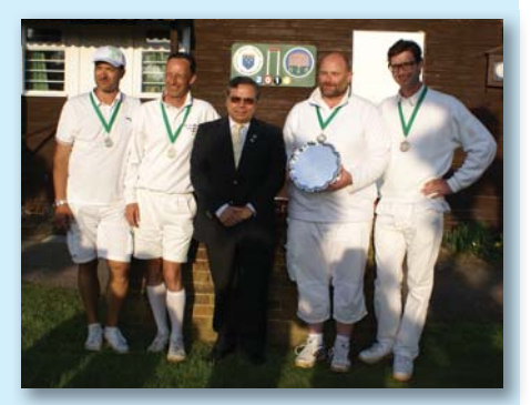
Tier 3 winners - Austria

Austria, together with Germany and Norway, were also competing for the Tier 3 trophy, and with five wins out of six finished very worthy winners.