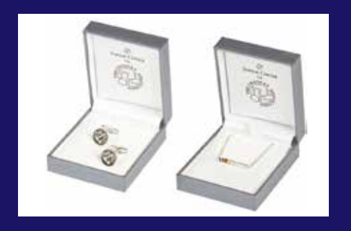
NEW Simon Carter range of jewellery