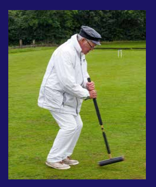
Wet weather clothing