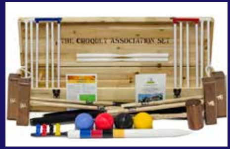
Balls, hoops and sets