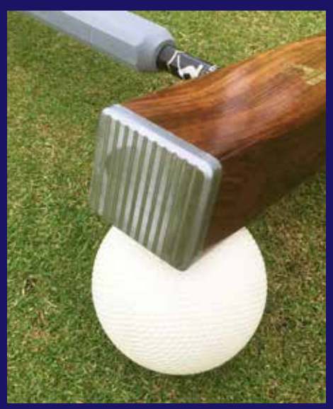
The George Wood range of croquet mallets