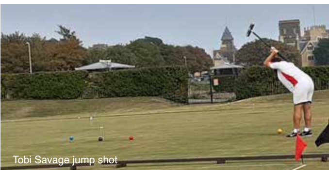
Tobi Savage jump shot