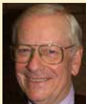
Croquet Player Turf Specialist