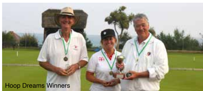
Hoop Dreams Winners