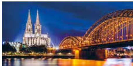
Amsterdam > Basel Departs March - October 2024