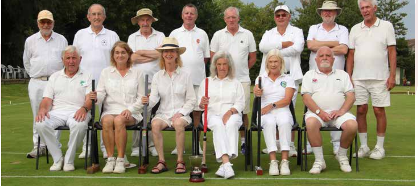
2023 All England Finalists