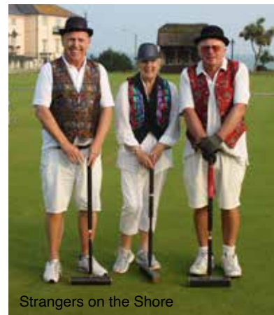
Strangers on the Shore