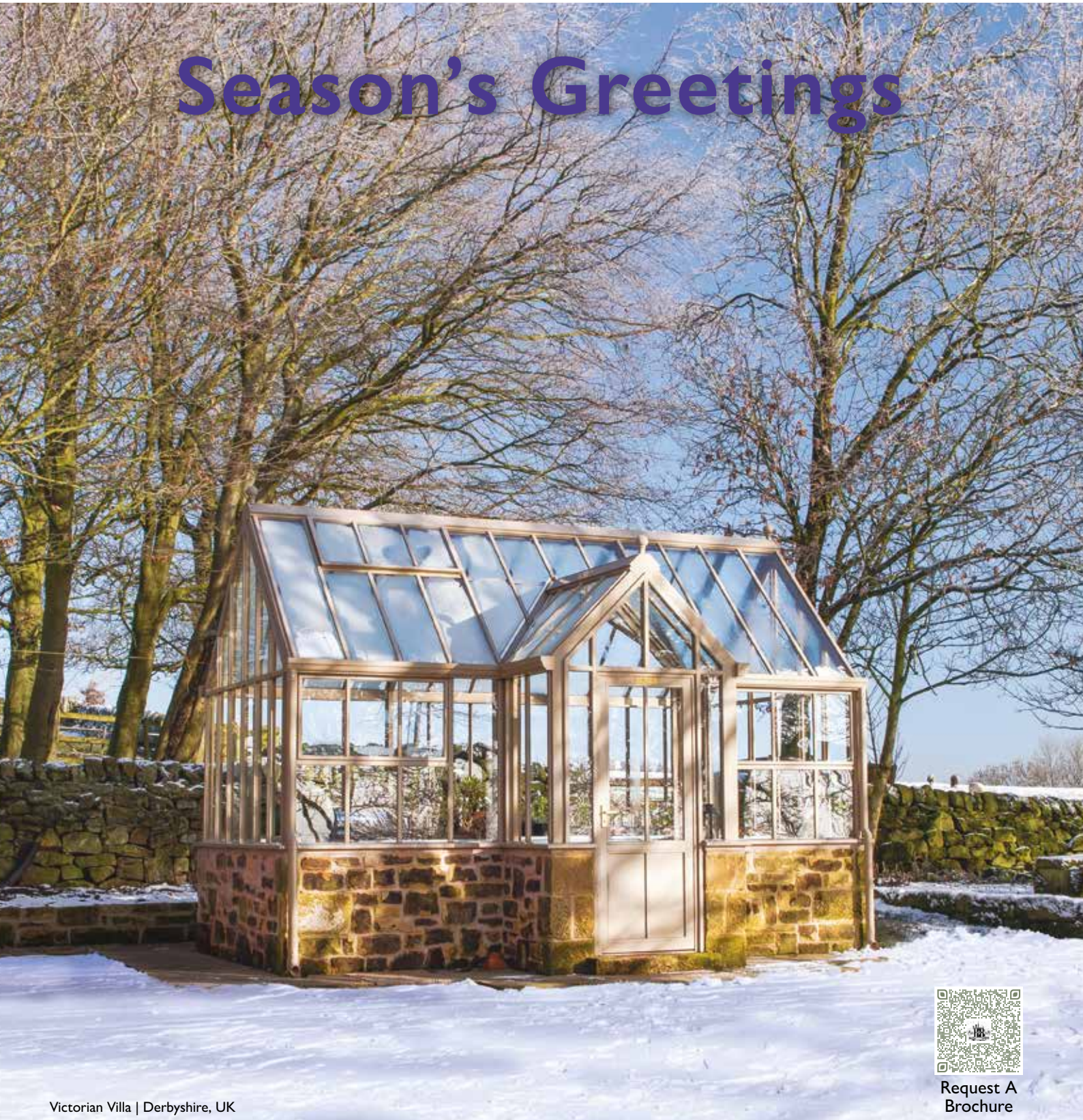
Victorian Villa | Derbyshire, UK