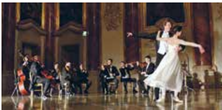
Nuremberg > Budapest Departs April - October 2024