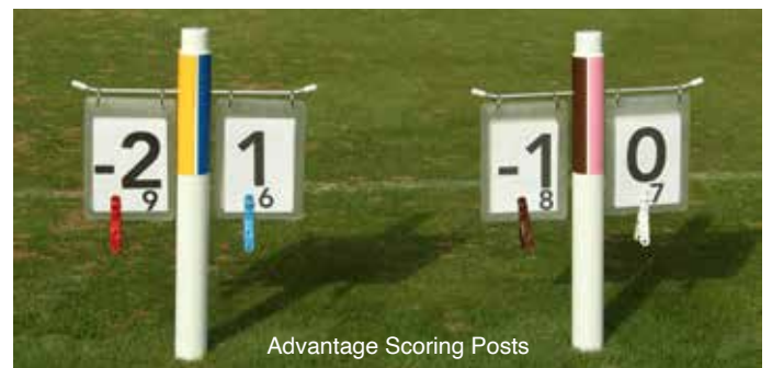
Advantage Scoring Posts