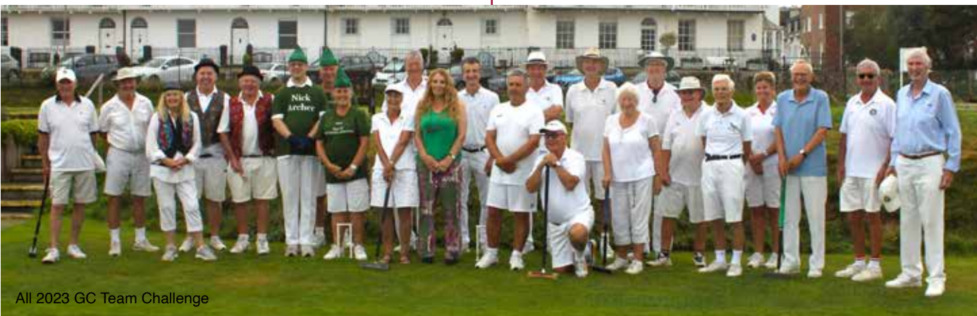
All 2023 GC Team Challenge