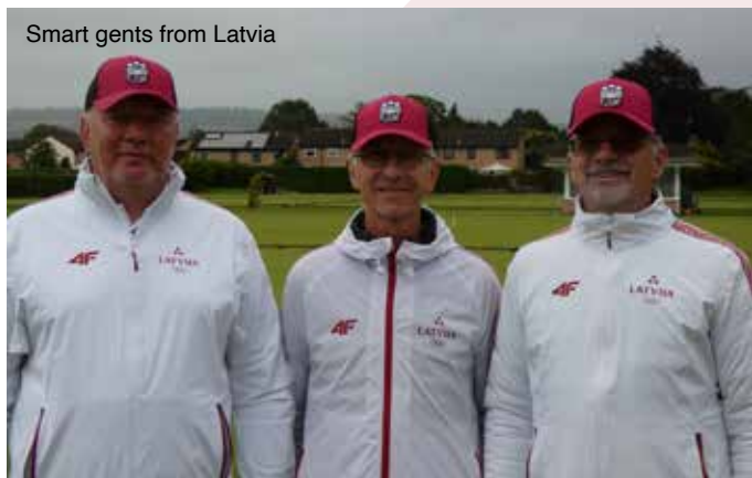
Smart gents from Latvia