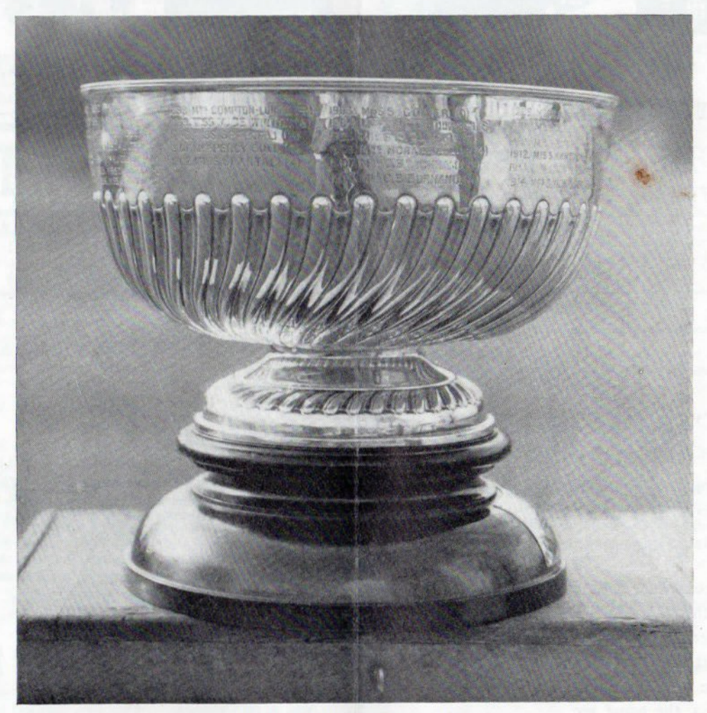
PEEL MEMORIAL BOWL

The Official Organ of The Croquet Association