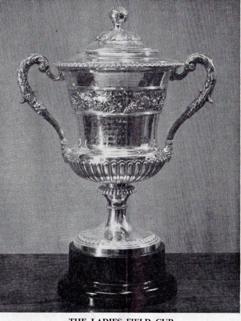
available lady players in each year.