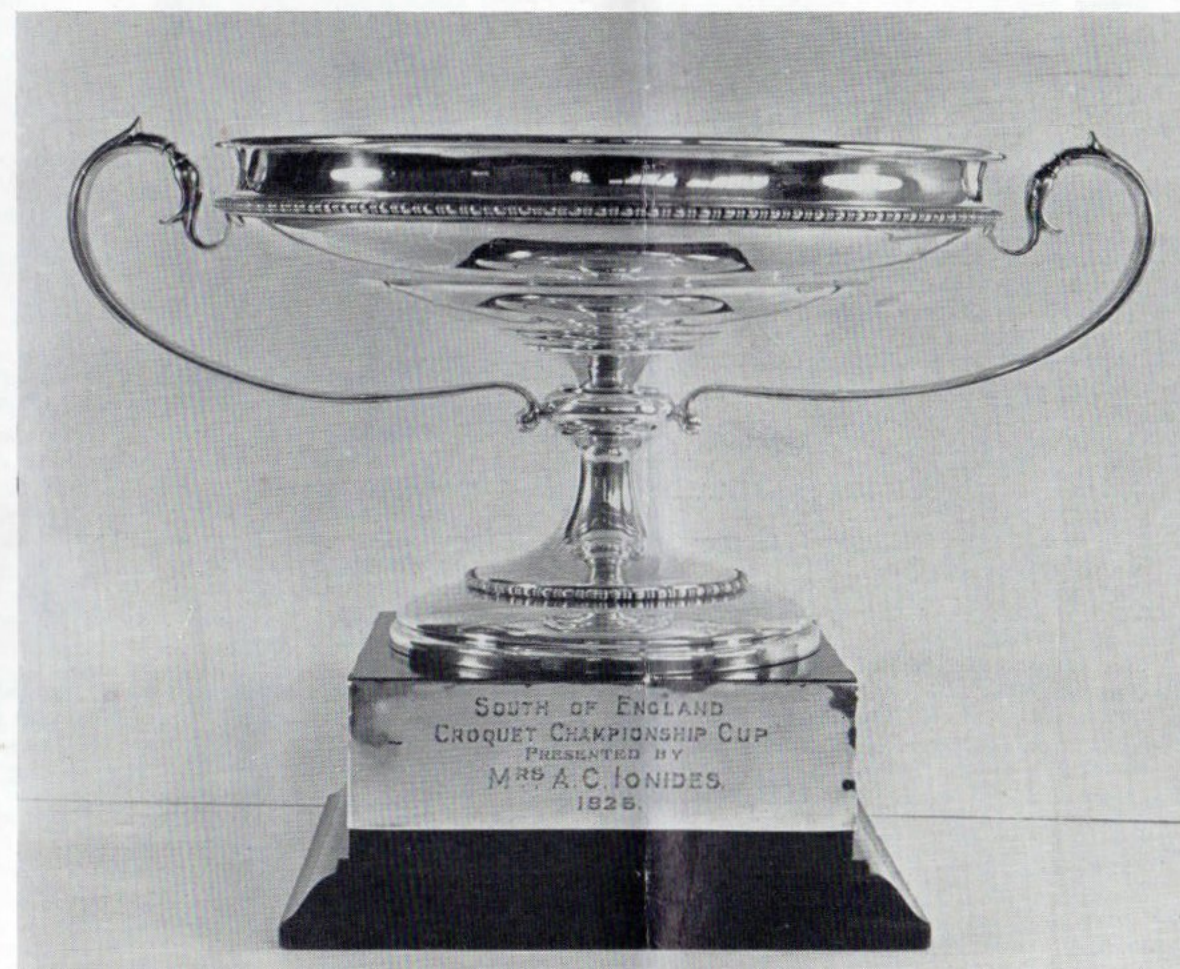
IONIDES CHALLENGE TROPHY

The Official Organ of The Croquet Association